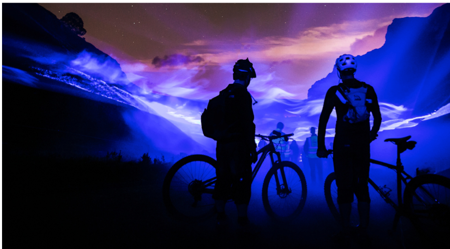
Waterlicht by Studio Roosegaarde (2017)

You will be someone who attends arts events and who is committed to defending artistic freedom. You will also be able to commit the amount of time needed to the role (approximately one day per month). You will have a strong desire to contribute to public life and will be committed to the Nolan Principles of Public Life (see below).