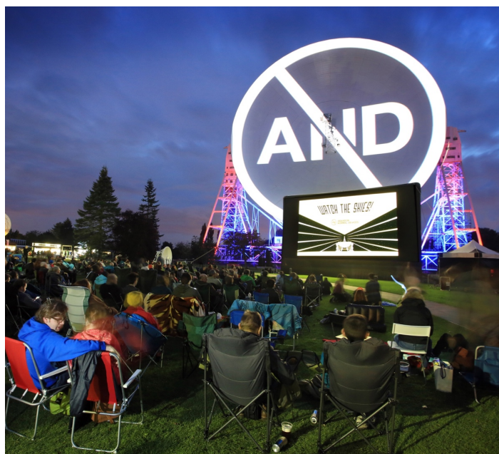
Watch the Skies! at Jodrell Bank Observatory (2014)